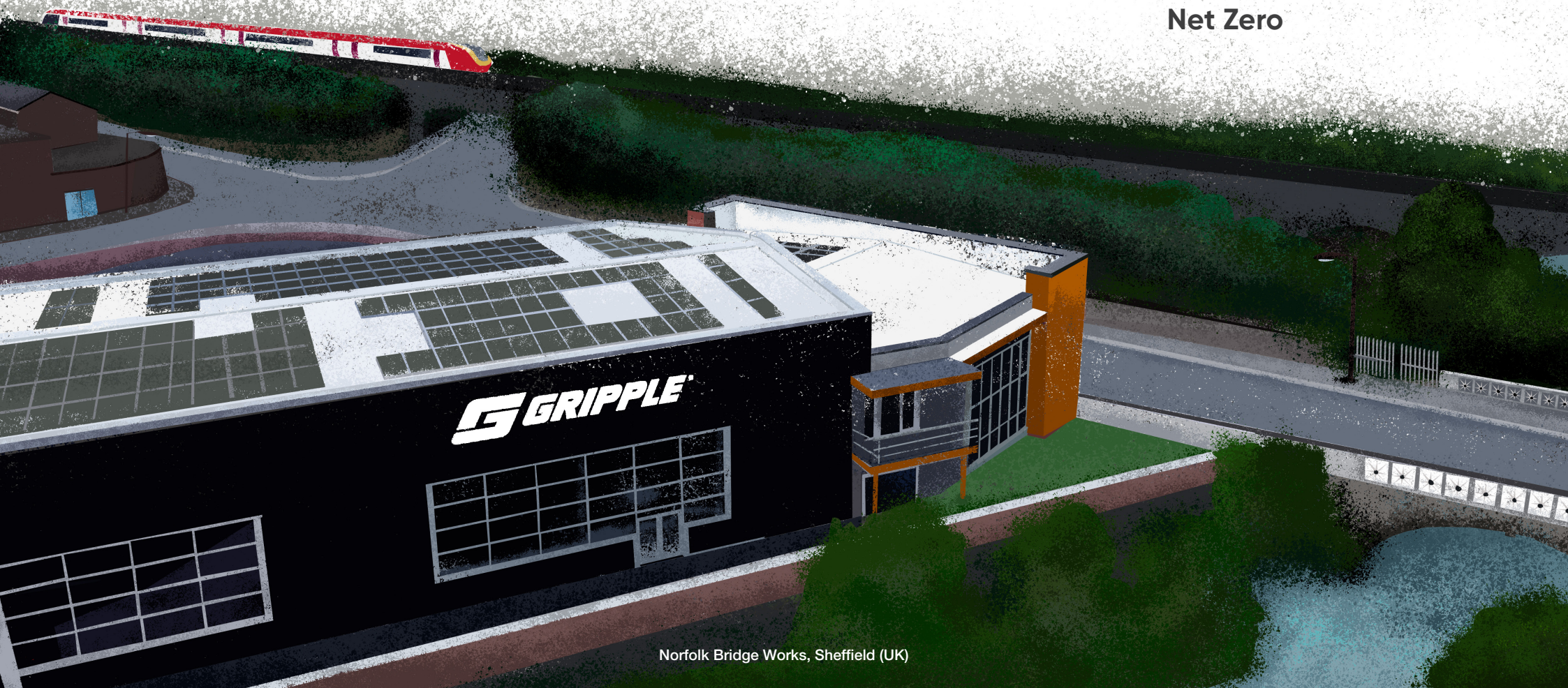
Norfolk Bridge Works, Sheffield (UK)